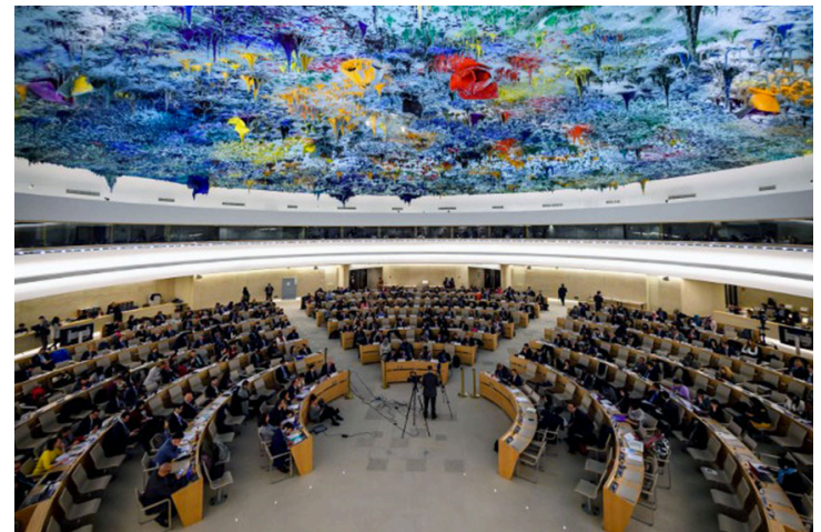
The ceiling of the Palais des Nations, in the United Nation Office in Geneva