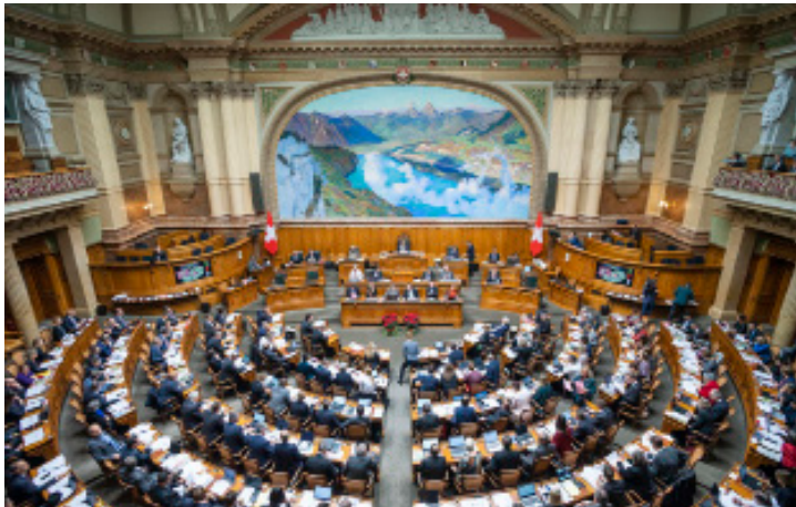
Federal Assembly inside the Swiss Parliament, Bern