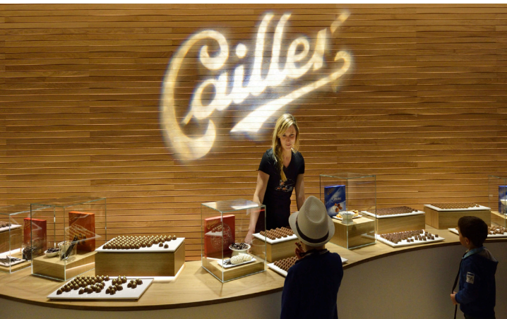
Tasting room in the Cailler Chocolate Fac- tory, Fribourg