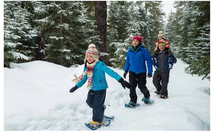
Snow-shoeing, a typical Swiss winter sport in the moutains