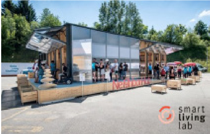
Smart Living Lab in the Blue Factory, the innovation/start-up counpound, Fribourg