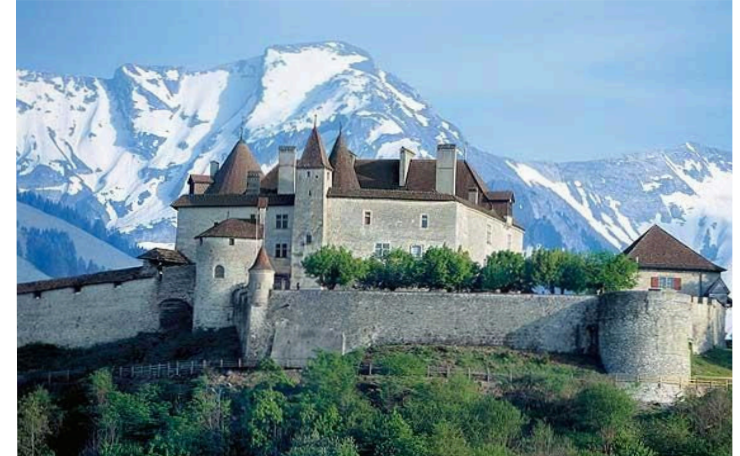
Gruyères Castle, Fri- bourg